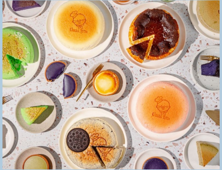
Japanese Fluffy Cheesecakes 4609 Convoy St Suite D