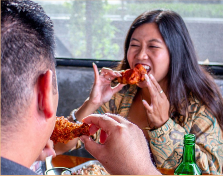
Korean Fried Chicken and more 4403 Convoy St