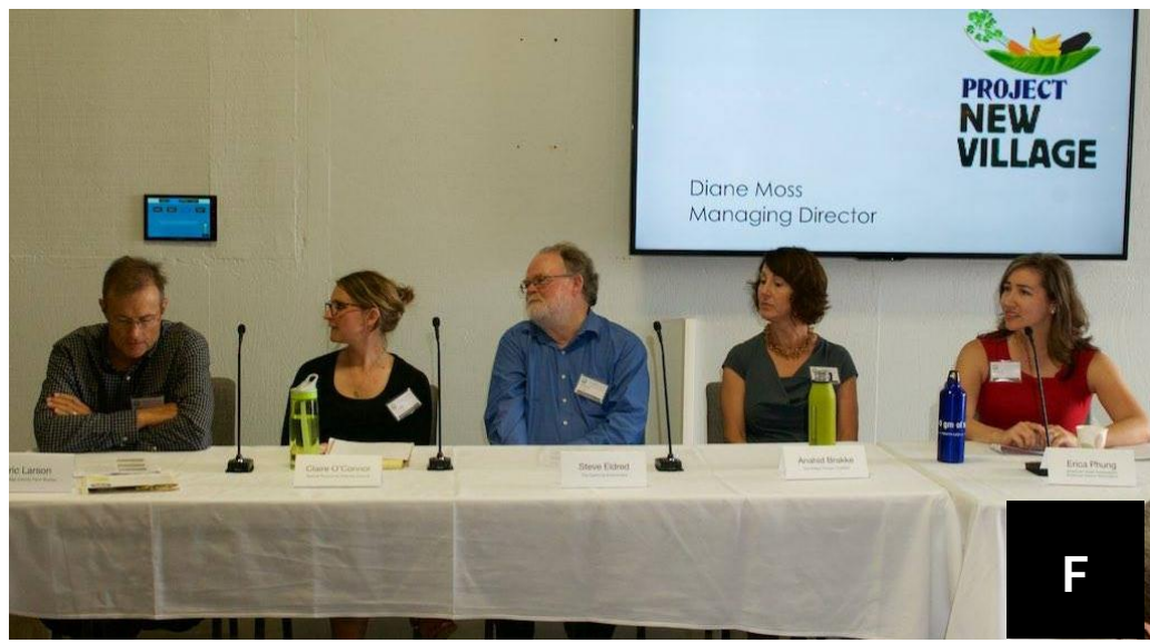
A/B- Future of Tuna Harbor: Focus on Win-Win (4/13) C/D/E/F/G- Farm Bill Forum San Diego: Hunger, Poverty, and Agriculture (7/26) H/I/J/K/L- Food Waste Solution Summit 3 (9/26)